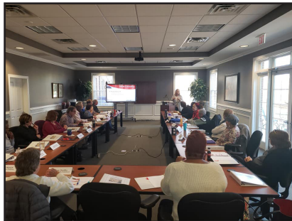
First Session held at the UMF Building

We would like to extend special thanks to the participants, the presenters, and the WNCC Office of Treasury Services for this ministry offering.