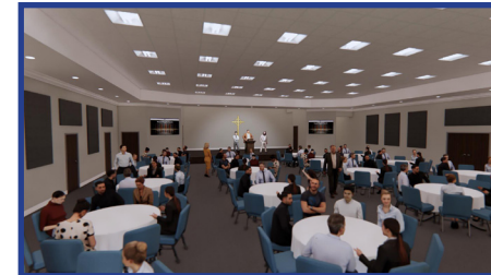
Artists' rendering of the new Fellowship Hall under construction at Mt. Pisgah UMC.