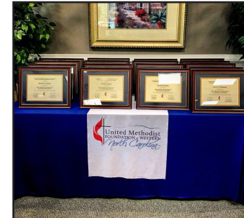
Certificates of Completion