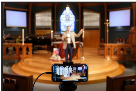
A United Methodist Church holds virtual worship.

Grant Guidelines and Application will be available on January 13, 2021 on the Foundation website: umfwnc.org/organizations/ministry-grants/